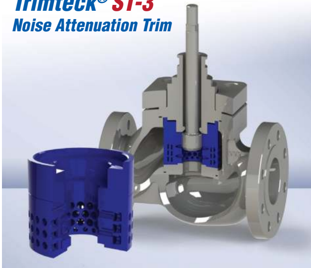
Trimteck® ST-3 Noise Attenuation Trim