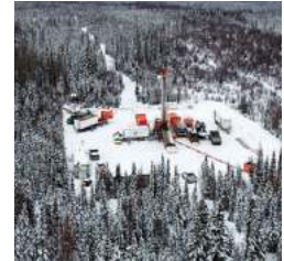
Trimteck's Optimux OpGL-XT Control Valves at an Alberta SAGD Plant